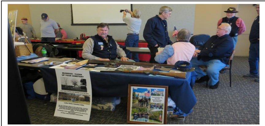
Our "Brothers" from Camp 15, Wind Lake/Muskego, WI

JOIN US FOR THE FIRST TENT #23 MEETING OF 2017 AS WE CELEBRATE "The Heroines of the Civil War"